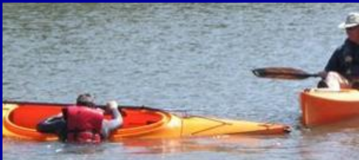
This is an important message about wearing your PFD!!