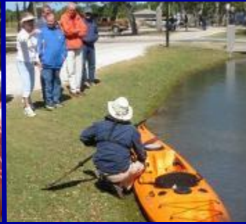
Hello Folks - This thing is a kayak and the bottom must be on the water.