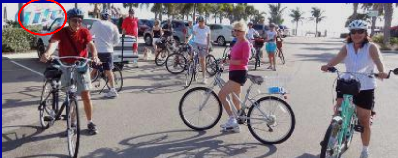
Do I see a Miller "Lite" truck. What a great place to stop & rest!