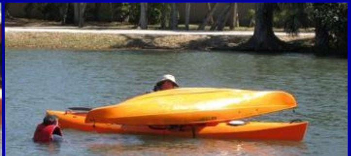
It's OK Joe. I've got your kayak-you can walk to shore.