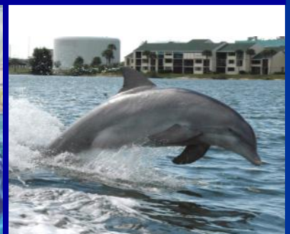
Daphne the Dolphin