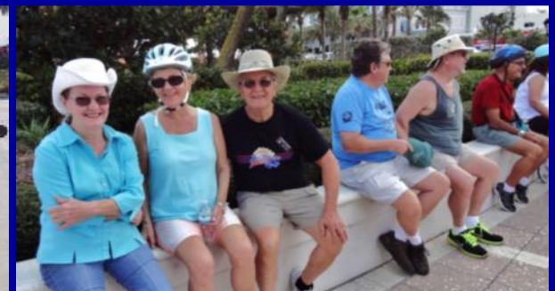
Where did that beer truck go? Come back!!